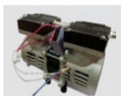
High Vacuum Pump