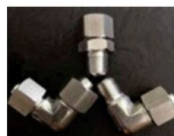
Stainless Steel Connectors