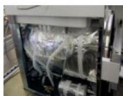
Aluminum Foil Installation